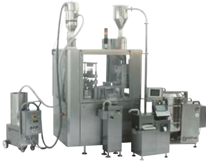
Pneumatic conveyor (left) and capsule pusher (right), in a pharmaceutical company.

Pneumatic conveyors are designed to transport powders and granules from one point to another without changing the mix. These systems are often used to feed automatic machines. The ATEX versions abide by the safety standards used in food production and the chemical-pharmaceutical industry.