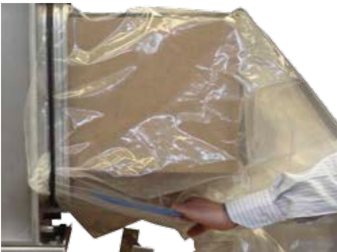
Bag-In Bag-Out filter system