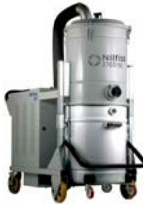
7.5 kW three-phase up to 18.5