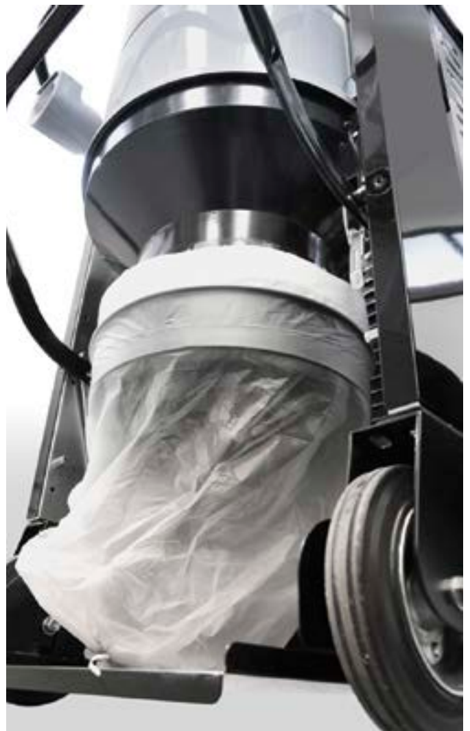
Longopac® "endless" collection system

For more information, contact customer service +39 059 9730000. Send an e-mail to info@nilfisk-cfm.com or visit our website industrial-vacuum.nilfisk.com .