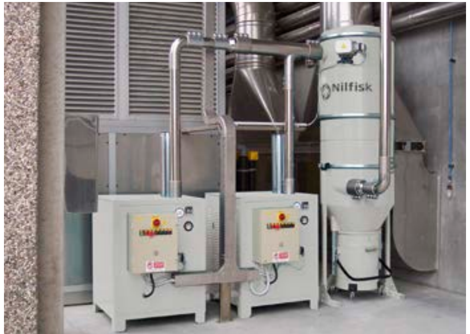
Centralized vacuum system in a chemical company: 2 vacuum units, 1 filter silo.

Centralized vacuum systems are the ideal solution for vacuum applications required in several places simultaneously, and in large environments that may have very different features. ATEX certified systems are often the only choice for large industrial production.