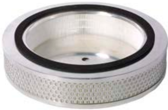
Upstream absolute filter

Visit the site industrial-vacuum.nilfisk.com for a free accessories catalogue, including optionals and separators for your vacuum: you'll find the perfect solution to meet your own specific requirements.