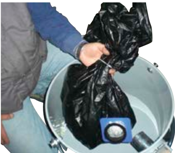
Safe Bag filter