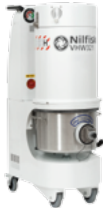
Three-phase up to 4 kW