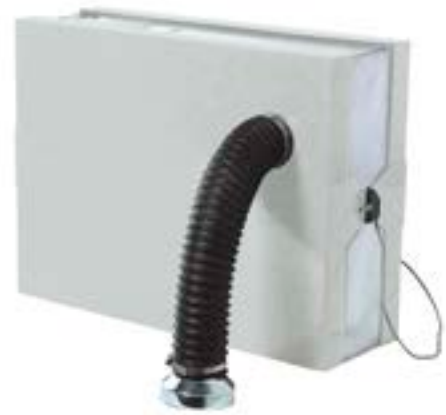
Downstream HEPA filter