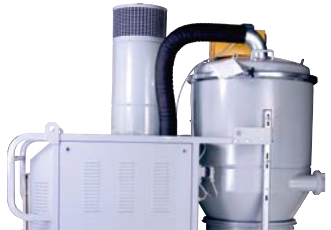
Air outlet diffuser