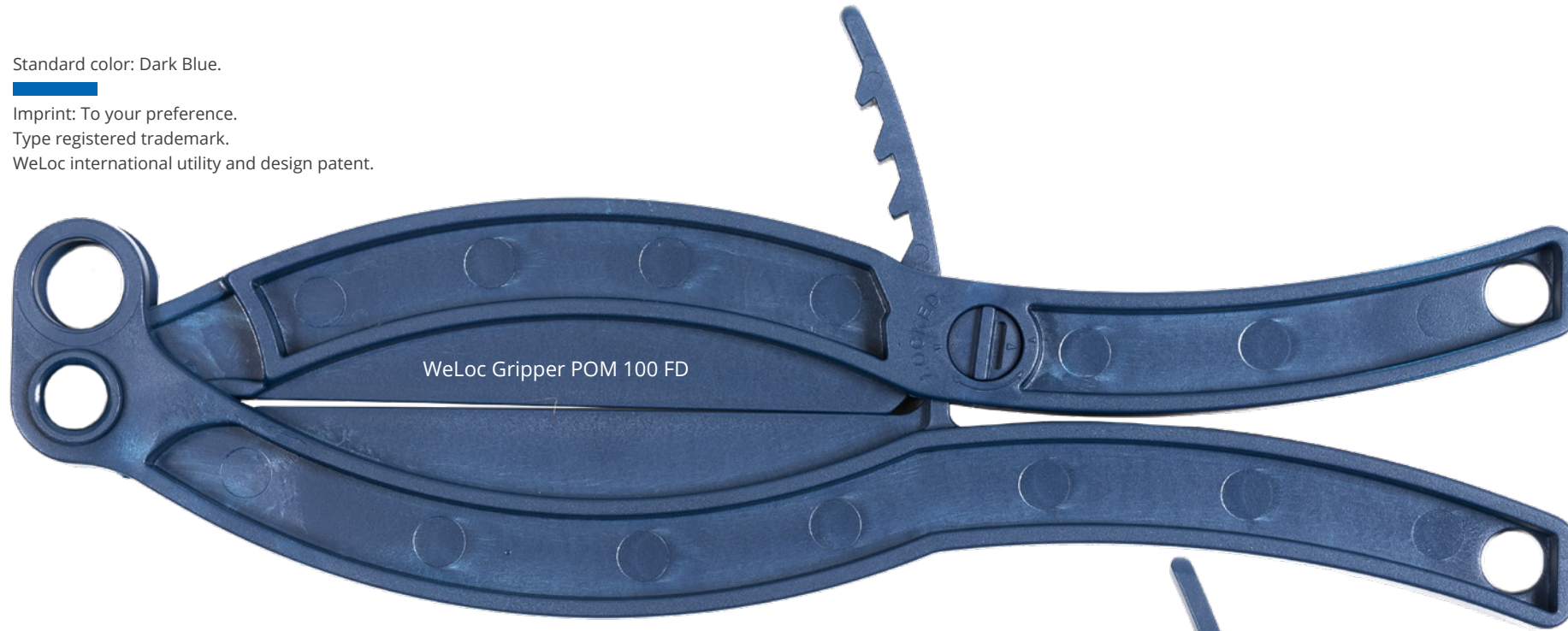
WeLoc Gripper POM 100 FD

WeLoc international utility and design patent.