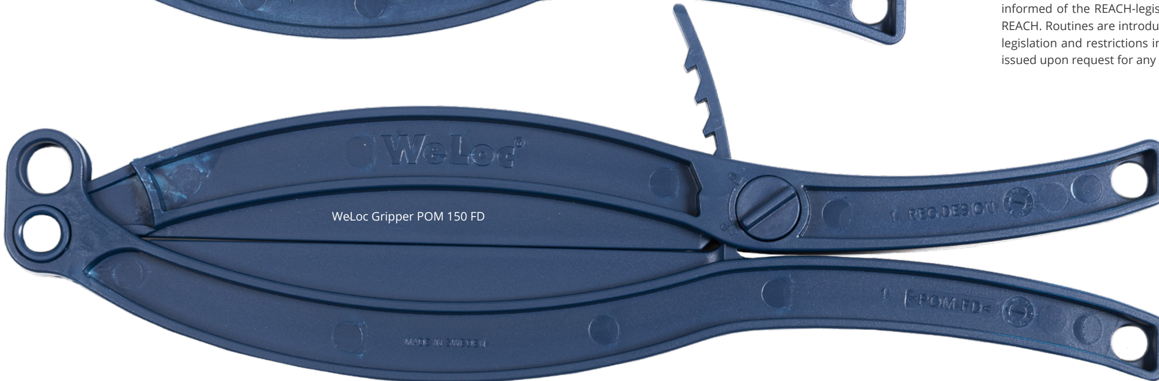
WeLoc Gripper POM 150 FD