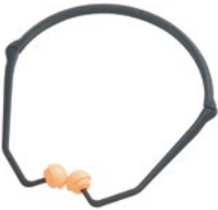
PerCap® Folding semi-aural protection