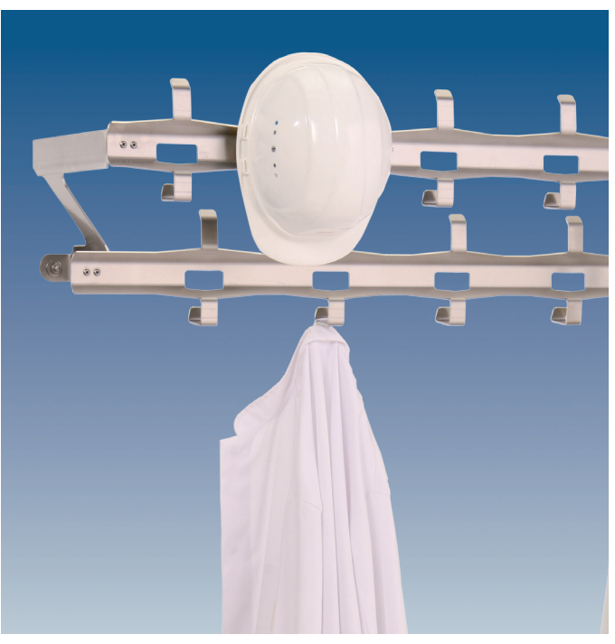
■ Photo 12: Wardrobe for helmets and aprons - 2 lines, hook distance 200 mm

■ A robust and operation-safe model guarantees a problemfree use during the daily work.