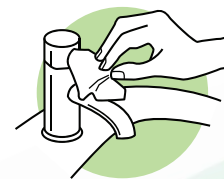
Turn Off Tap